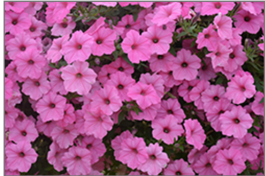
Supertunia Vista Bubblegum Petunia flowers

Supertunia Vista Bubblegum Petunia is recommended for the following landscape applications;