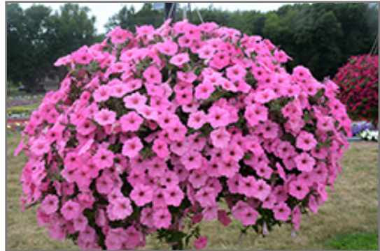
Supertunia Vista Bubblegum Petunia in bloom

Supertunia Vista Bubblegum Petunia is a fine choice for the garden, but it is also a good selection for planting in outdoor containers and hanging baskets. Because of its trailing habit of growth, it is ideally suited for use as a 'spiller' in the 'spiller-thriller-filler' container combination; plant it near the edges where it can spill gracefully over the pot. Note that when growing plants in outdoor containers and baskets, they may require more frequent waterings than they would in the yard or garden.