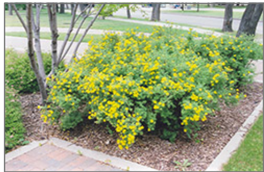
Coronation Triumph Potentilla in bloom