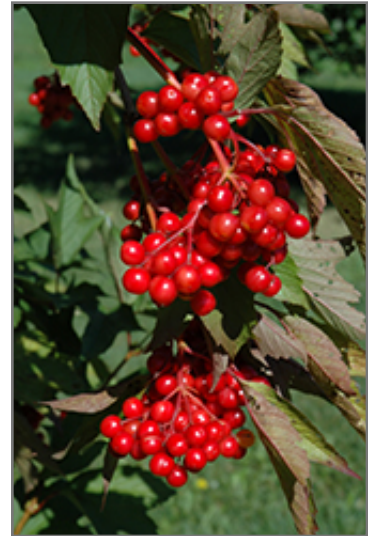
Hahs American Cranberry fruit

This is a relatively low maintenance shrub, and should only be pruned after flowering to avoid removing any of the current season's flowers. It is a good choice for attracting birds to your yard, but is not particularly attractive to deer who tend to leave it alone in favor of tastier treats. It has no significant negative characteristics.