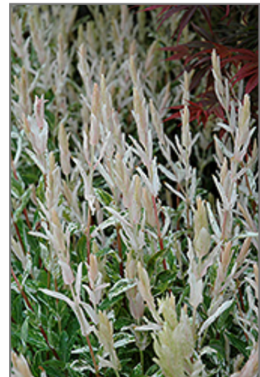
Tricolor Willow foliage