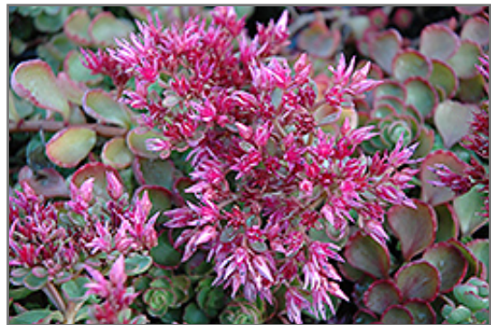
Fuldaglut Stonecrop flowers