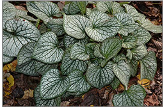
Jack Frost Bugloss