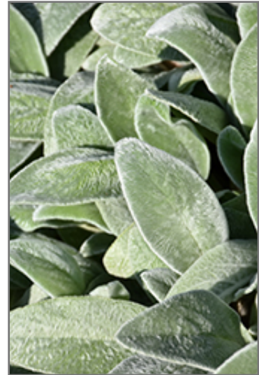
Lamb's Ears foliage

Lamb's Ears is recommended for the following landscape applications;