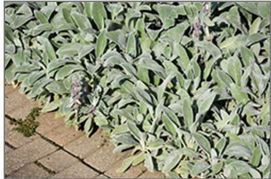
Lamb's Ears

Lamb's Ears will grow to be about 12 inches tall at maturity extending to 24 inches tall with the flowers, with a spread of 18 inches. When grown in masses or used as a bedding plant, individual plants should be spaced approximately 15 inches apart. Its foliage tends to remain dense right to the ground, not requiring facer plants in front. It grows at a fast rate, and under ideal conditions can be expected to live for approximately 10 years.