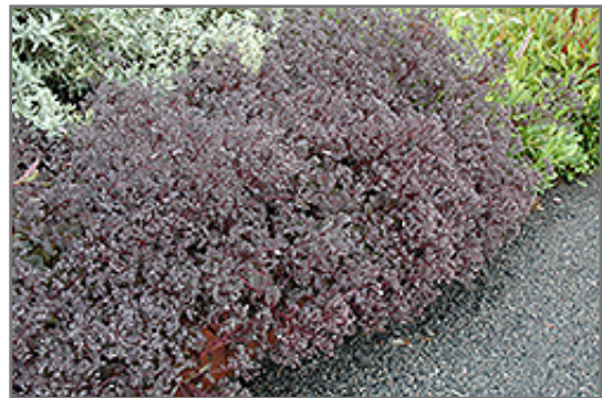
Bertram Anderson Stonecrop