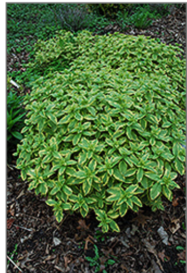
Golden Alexander Loosestrife

7800 Roblin Boulevard Headingley, MB R4H 1B6