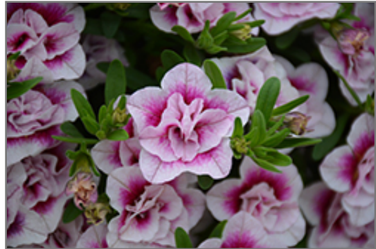
MiniFamous Uno Double PinkTastic Calibrachoa flowers

MiniFamous Uno Double PinkTastic Calibrachoa is a dense herbaceous annual with a trailing habit of growth, eventually spilling over the edges of hanging baskets and containers. Its medium texture blends into the garden, but can always be balanced by a couple of finer or coarser plants for an effective composition.