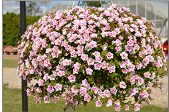
MiniFamous Uno Double PinkTastic Calibrachoa in bloom