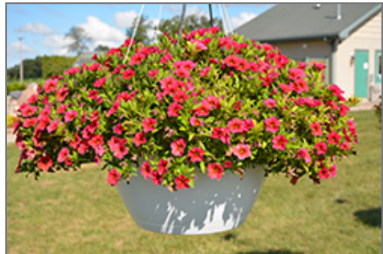
Superbells Tabletop Red Calibrachoa in bloom