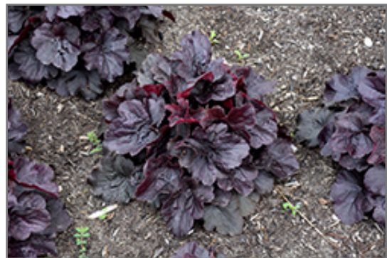
Northern Exposure Black Coral Bells