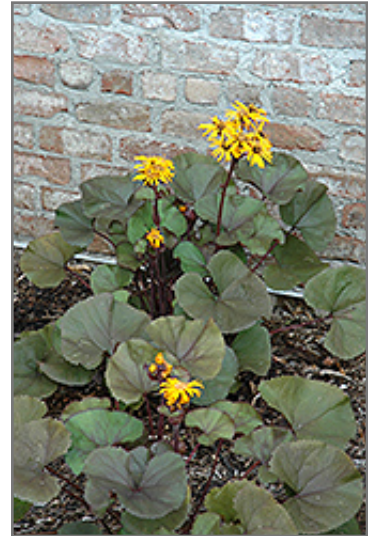
Britt Marie Crawford Rayflower in bloom