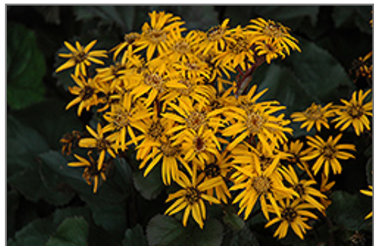
Britt Marie Crawford Rayflower flowers