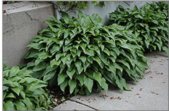
Invincible Hosta

Invincible Hosta is recommended for the following landscape applications;