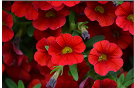
MiniFamous Neo Vampire Calibrachoa flowers

MiniFamous Neo Vampire Calibrachoa is a dense herbaceous annual with a trailing habit of growth, eventually spilling over the edges of hanging baskets and containers. Its medium texture blends into the garden, but can always be balanced by a couple of finer or coarser plants for an effective composition.