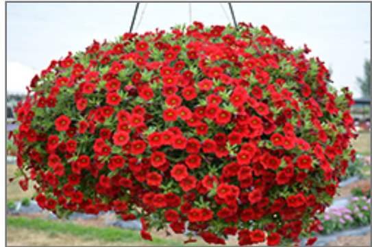
MiniFamous Neo Vampire Calibrachoa in bloom