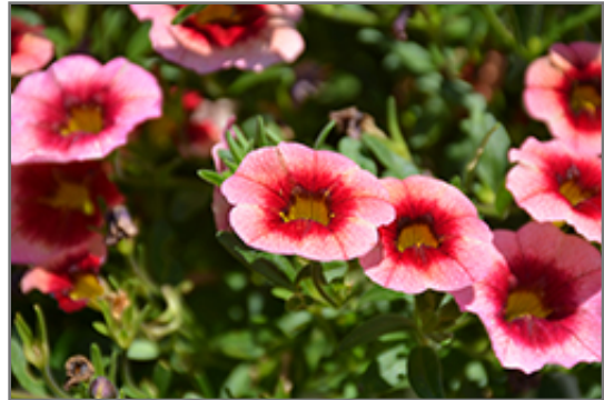
MiniFamous Neo Pink Strike Calibrachoa flowers

MiniFamous Neo Pink Strike Calibrachoa is recommended for the following landscape applications;