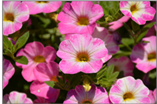
Chameleon Pink Sorbet Calibrachoa flowers

Chameleon Pink Sorbet Calibrachoa is recommended for the following landscape applications;