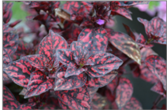
Hippo Red Polka Dot Plant foliage

This is an herbaceous evergreen houseplant with a mounded form. This plant should not require much pruning, except when necessary to keep it looking its best.