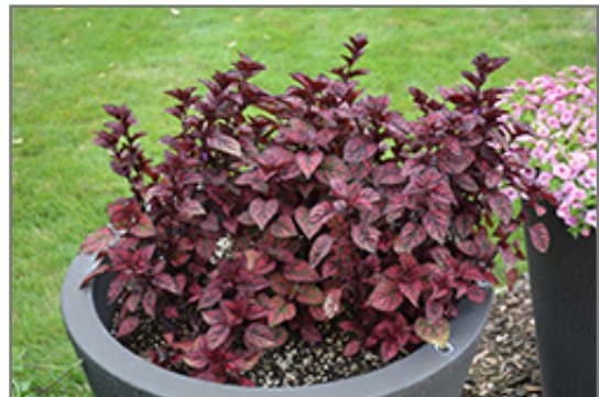
Hippo Red Polka Dot Plant

7800 Roblin Boulevard Headingley, MB R4H 1B6