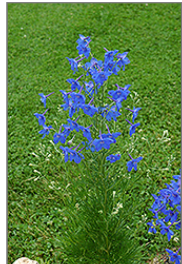
Chinese Delphinium flowers