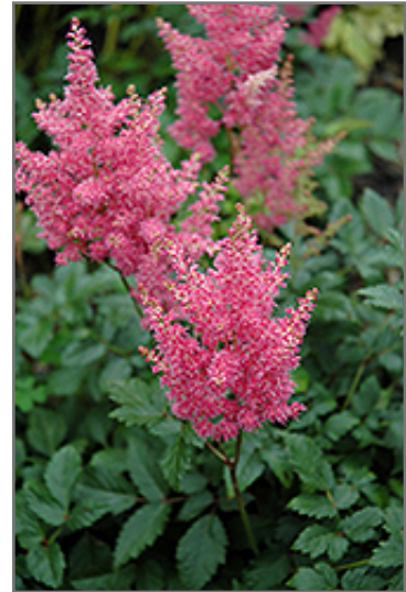
Rheinland Astilbe flowers