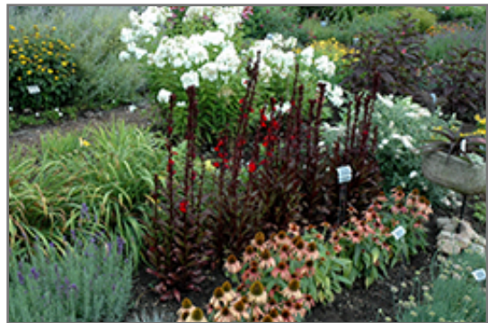
Vulcan Red Lobelia in bloom