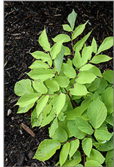
Sun King Japanese Spikenard foliage

This plant performs well in both full sun and full shade. It prefers to grow in average to moist conditions, and shouldn't be allowed to dry out. It is not particular as to soil type or pH. It is highly tolerant of urban pollution and will even thrive in inner city environments. This is a selected variety of a species not originally from North America.