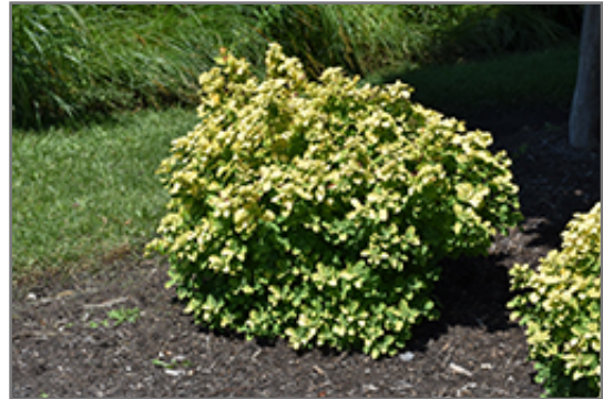
Glow Girl Birch Leaf Spirea

Glow Girl Birch Leaf Spirea is recommended for the following landscape applications;