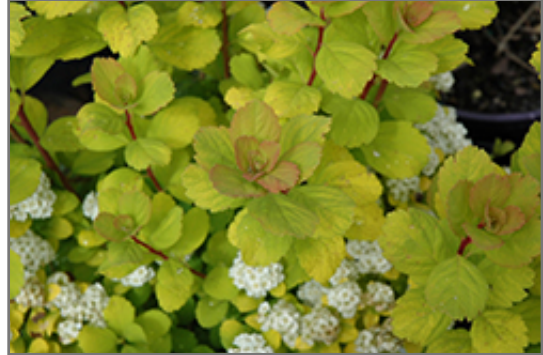
Glow Girl Birch Leaf Spirea foliage

This shrub should only be grown in full sunlight. It prefers to grow in average to moist conditions, and shouldn't be allowed to dry out. It is not particular as to soil type or pH. It is highly tolerant of urban pollution and will even thrive in inner city environments. This is a selected variety of a species not originally from North America.