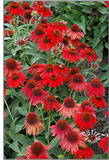
Sombrero Salsa Red Coneflower flowers

This is a relatively low maintenance plant, and is best cleaned up in early spring before it resumes active growth for the season. It is a good choice for attracting butterflies to your yard, but is not particularly attractive to deer who tend to leave it alone in favor of tastier treats. It has no significant negative characteristics.