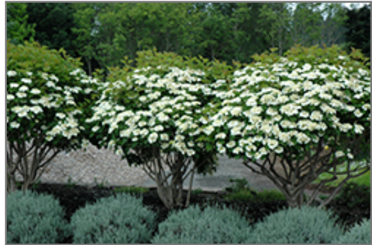
Compact European Cranberry in bloom

Compact European Cranberry is a dense multi-stemmed deciduous shrub with a more or less rounded form. Its average texture blends into the landscape, but can be balanced by one or two finer or coarser trees or shrubs for an effective composition.