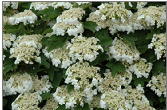
Compact European Cranberry flowers