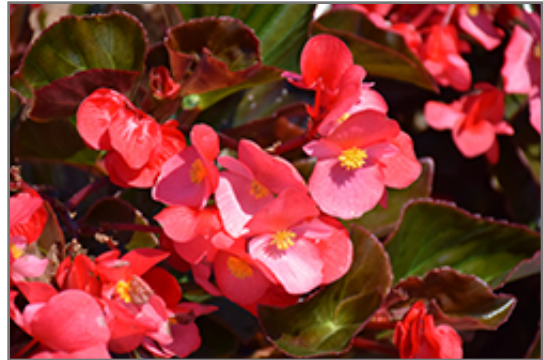
Whopper Rose Bronze Leaf Begonia flowers

This is a high maintenance plant that will require regular care and upkeep, and usually looks its best without pruning, although it will tolerate pruning. Deer don't particularly care for this plant and will usually leave it alone in favor of tastier treats. Gardeners should be aware of the following characteristic(s) that may warrant special consideration;