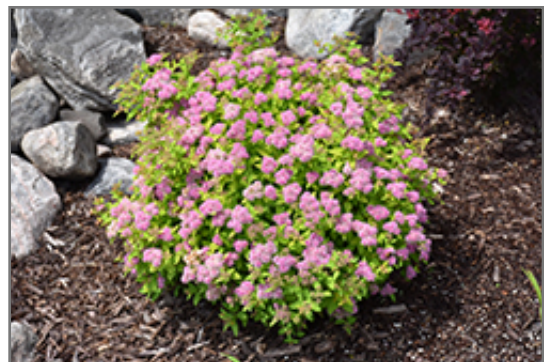
Dakota Goldcharm Spirea in bloom