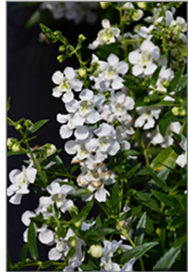
AngelMist Spreading White Angelonia flowers

AngelMist Spreading White Angelonia is an herbaceous annual with an upright spreading habit of growth. Its relatively fine texture sets it apart from other garden plants with less refined foliage.