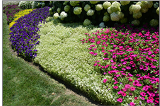
Frosty Knight Alyssum in bloom

Frosty Knight Alyssum is a fine choice for the garden, but it is also a good selection for planting in hanging baskets. Because of its trailing habit of growth, it is ideally suited for use as a 'spiller' in the 'spiller-thriller-filler' container combination; plant it near the edges where it can spill gracefully over the pot. Note that when growing plants in outdoor containers and baskets, they may require more frequent waterings than they would in the yard or garden.