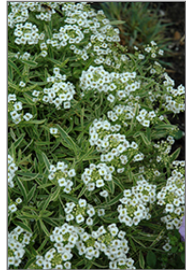
Frosty Knight Alyssum flowers

This plant will require occasional maintenance and upkeep, and should not require much pruning, except when necessary, such as to remove dieback. It is a good choice for attracting bees and butterflies to your yard, but is not particularly attractive to deer who tend to leave it alone in favor of tastier treats. It has no significant negative characteristics.