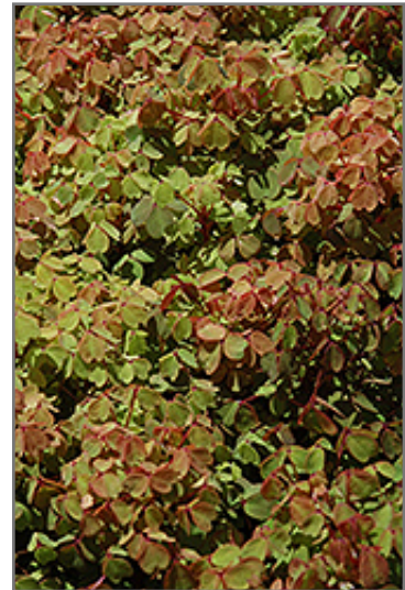
Sunset Velvet Shamrock foliage

7800 Roblin Boulevard Headingley, MB R4H 1B6