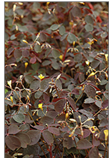
Burgundy Bliss Shamrock flowers

7800 Roblin Boulevard Headingley, MB R4H 1B6