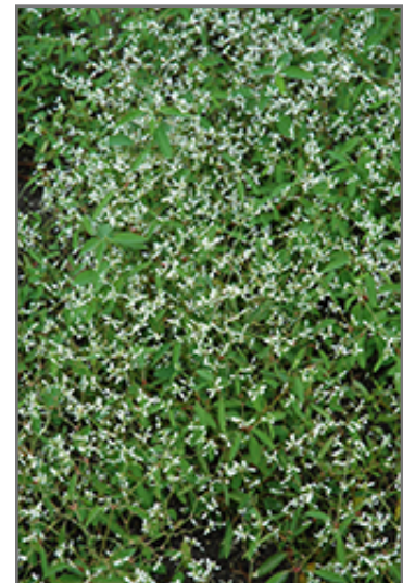
Breathless White Euphorbia flowers