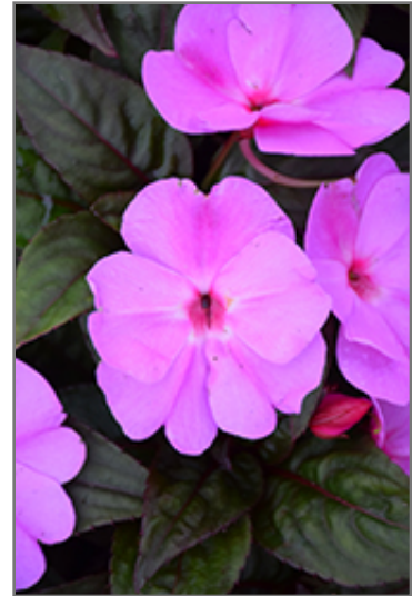
Divine Lavender New Guinea Impatiens flowers

Divine Lavender New Guinea Impatiens is recommended for the following landscape applications;