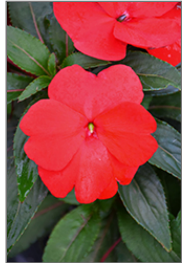
Super Sonic Red New Guinea Impatiens flowers

Super Sonic Red New Guinea Impatiens is recommended for the following landscape applications;