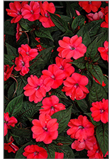
SunPatens Compact Deep Rose New Guinea Impatiens flowers

This plant will require occasional maintenance and upkeep, and should not require much pruning, except when necessary, such as to remove dieback. It is a good choice for attracting bees and butterflies to your yard. It has no significant negative characteristics.