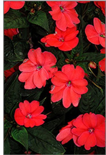
SunPatiens Compact Coral New Guinea Impatiens flowers

SunPatiens Compact Coral New Guinea Impatiens is recommended for the following landscape applications;