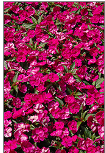
Fanfare Fuchsia Impatiens flowers