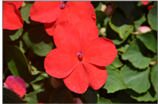
Super Elfin XP Melon Impatiens in bloom

Super Elfin XP Melon Impatiens is recommended for the following landscape applications;