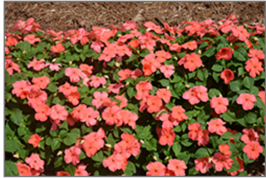
Super Elfin XP Melon Impatiens flowers

Super Elfin XP Melon Impatiens will grow to be about 10 inches tall at maturity, with a spread of 12 inches. When grown in masses or used as a bedding plant, individual plants should be spaced approximately 10 inches apart. Its foliage tends to remain low and dense right to the ground. This fast-growing annual will normally live for one full growing season, needing replacement the following year.