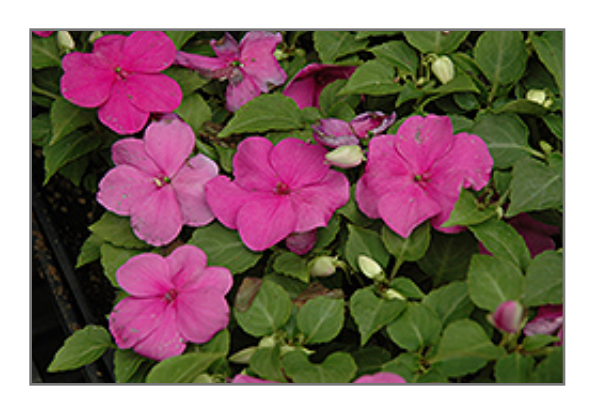
Super Elfin Lilac Impatiens flowers