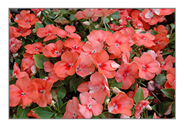
Super Elfin Apricot Impatiens flowers