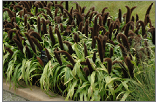
Jade Princess Millet in bloom

Jade Princess Millet is recommended for the following landscape applications;