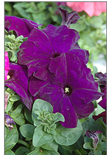
Dreams Midnight Petunia flowers

7800 Roblin Boulevard Headingley, MB R4H 1B6